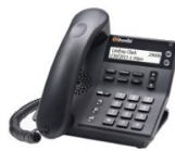
ShoreTel IP Phone 420

The SIP-based 400 series phones were recently introduced by ShoreTel. They are available in four models – IP 420, IP480, IP480G, and IP485G – ranging from a basic phone to a more advanced backlit, color display phone for executives. The 400 series phones have superior sound quality on the handset and speakerphone; multiple line appearances; an ergonomic design; easy to read display; and convenient access to features, including voice mail, directories and conferencing. They require a minimum software version of 14.2 to be supported on your ShoreTel system. Please note that the ShoreTel 200 series phones are still available and supported by ShoreTel.