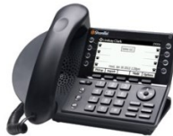
ShoreTel IP Phone 480g

8 lines, backlit grayscale display, Visual voicemail, 10/100 Ethernet