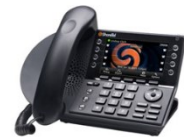
ShoreTel IP Phone 485g

8 lines, backlit grayscale display, Visual voice mail, Gigabit Ethernet