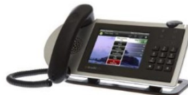
ShoreTel IP Phone 655

8 lines, backlit color display, Visual voice mail, Gigabit Ethernet